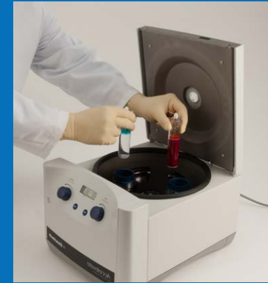
Light and portable centrifuge with full swinging bucket

This easy-to-use system provides a fast and convenient method for processing PRP at the point of care from a small amount of patient's blood.